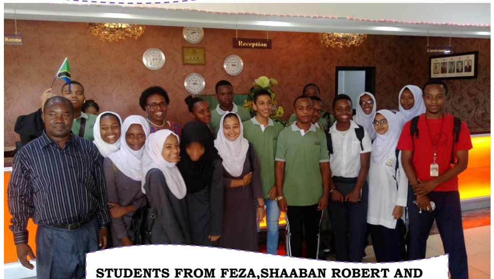
STUDENTS FROM FEZA,SHAABAN ROBERT AND AL MUNTAZIR (TANZANIAN TEAM)